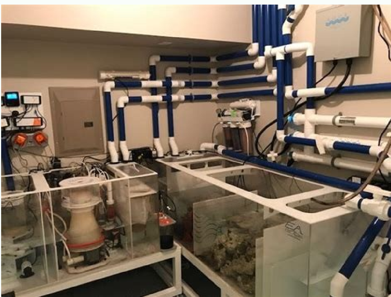
Setting up saltwater aquarium beginners. Beginners guide to setting up a saltwater aquarium. Tips for starting a saltwater aquarium. Beginners guide to saltwater aquarium. Saltwater tank beginners guide.